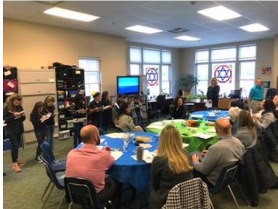
The journalism club interviewed committee members and showed a broadcast.

CJDS hosted special visitors last week, and for the first time, the Journalism Club recorded and shared a broadcast showcasing the special aspects of the school. (A link to the video was included in the January 17 th Ma Kora in the “Telling Our Story” section.)